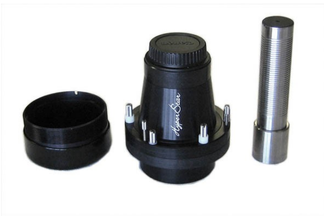
Secondary holder (shipped attached to lens), HyperStar lens, and counterweight